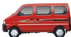
Metallic Passion Red