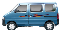
Metallic Breeze Blue