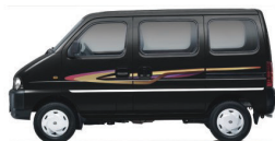
Pearl Midnight Black