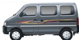
Metallic Glistening Grey