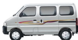
Metallic Silky Silver